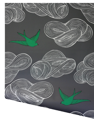
Daydream wallpaper in gray, $175 per roll, hyggeandwest.com