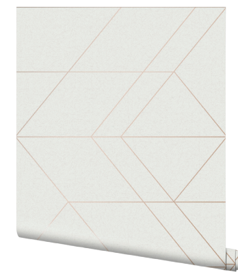
Balance wallpaper in white and rose gold, $120 per roll, grahambrown.com