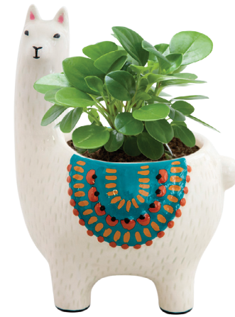
planter Llama 8 1/4"-tall ceramic planter, $32, naturallife.com