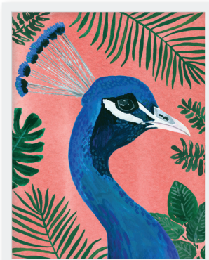
art Tropical Peacock by Lindsay Brackeen 11" x 14" unframed print, $33, lindsaybrackeen.etsy.com