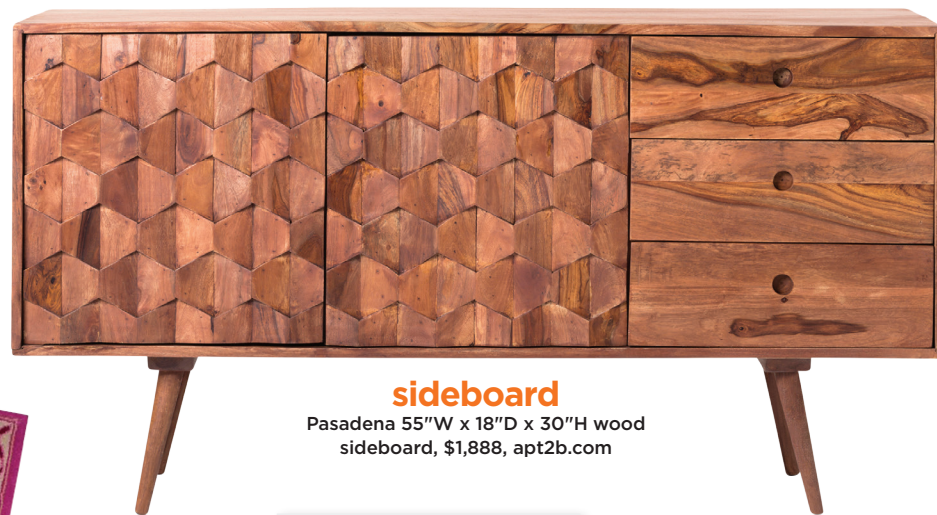
sideboard Pasadena 55"W x 18"D x 30"H wood sideboard, $1,888, apt2b.com