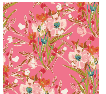
Bari J. Meadow removable wallpaper, $48 per 2' x 4' panel, wallalternatives.com