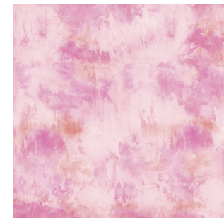
Peace wallpaper in pink, from $4.50 per square foot, muralswallpaper.com