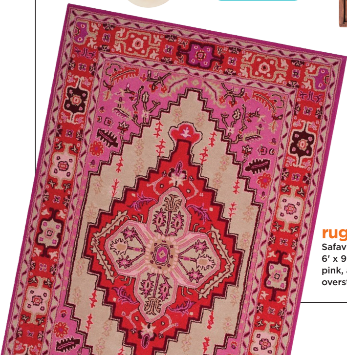
rug Safavieh Bellagio Gracia 6' x 9' wool rug in red, pink, and ivory, $183.50, overstock.com