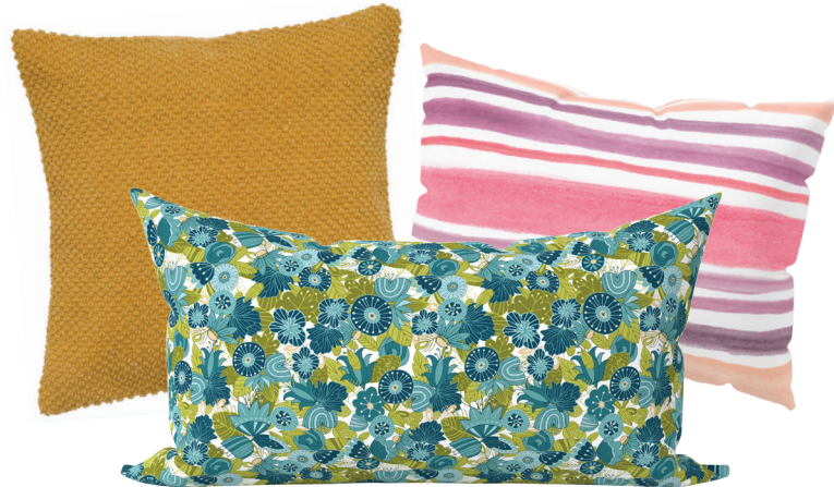
pillows Clockwise from left: Rizzy Home Textured 20" x 20" cotton and polyester pillow in yellow, $80, kohls.com; Sunny Day Stripes standard polyester shams in peach, $40 for a set of 2, society6.com; Whimsical Floral 14" x 24" linen and cotton pillow in blue and green, $54, spoonflower.com