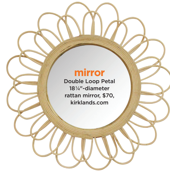
mirror Double Loop Petal 18 1/4"-diameter rattan mirror, $70, kirklands.com