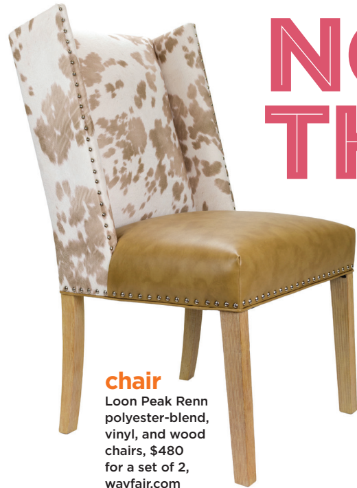
chair Loon Peak Renn polyester-blend, vinyl, and wood chairs, $480 for a set of 2, wayfair.com