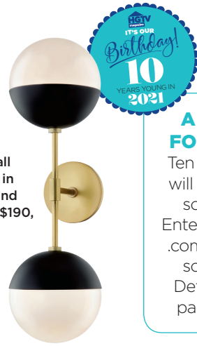
sconce Renee 22"-tall steel sconce in aged brass and black finish, $190, mitzi.com

A GIFT FOR YOU Ten readers will win this sconce. Enter at hgtv.com/mitzi-sconce . Details on page 107.