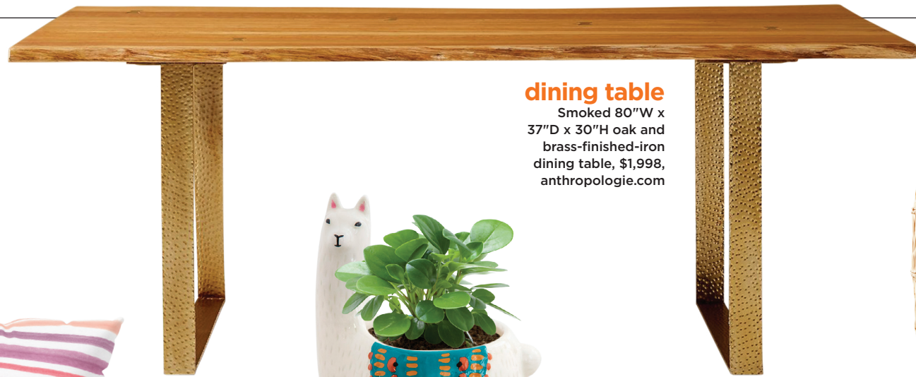
dining table Smoked 80"W x 37"D x 30"H oak and brass-finished-iron dining table, $1,998, anthropologie.com