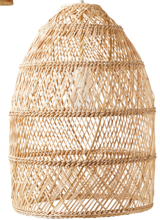
pendant Headlands Bell 14"-diameter rattan pendant in natural, $298, serenaandlily.com